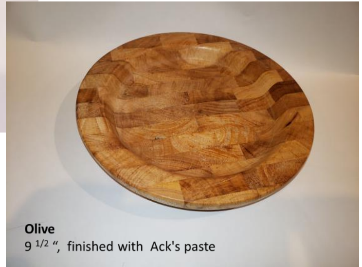
Olive 9 1/2 " , finished with Ack's paste