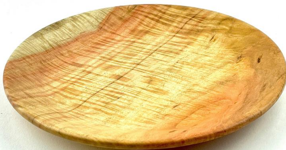
Carob 13", finish with Wipe-On Poly