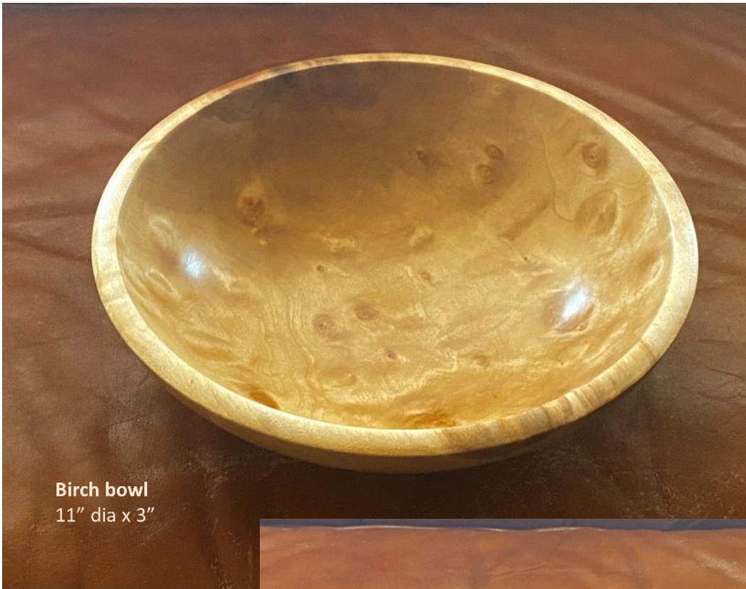
Birch bowl 11" dia x 3"