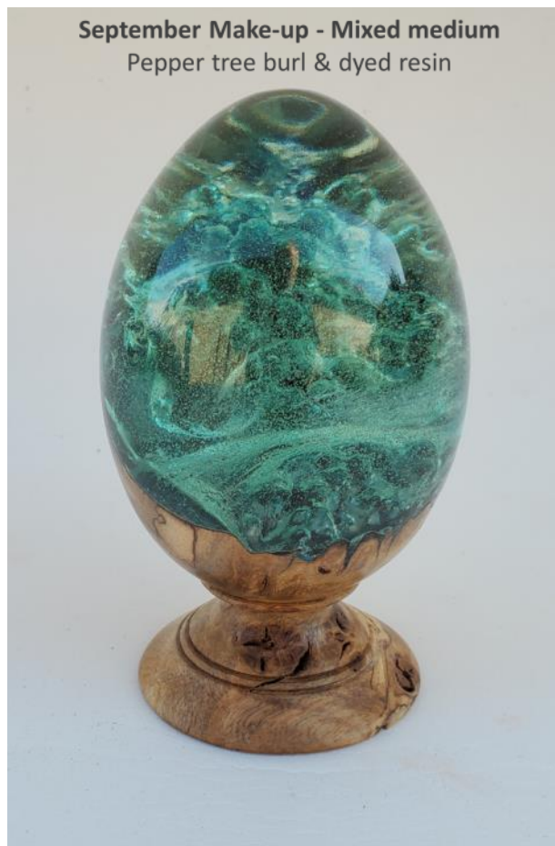
September Make-up - Mixed medium Pepper tree burl & dyed resin