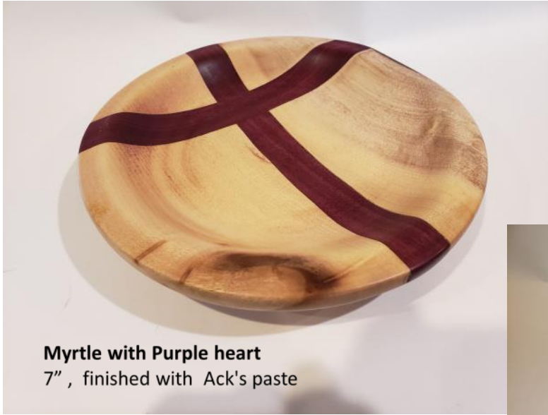
Myrtle with Purple heart 7" , finished with Ack's paste