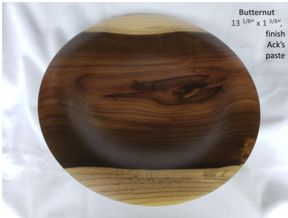
Butternut 13 1/8" x 1 3/8", finish Ack's paste