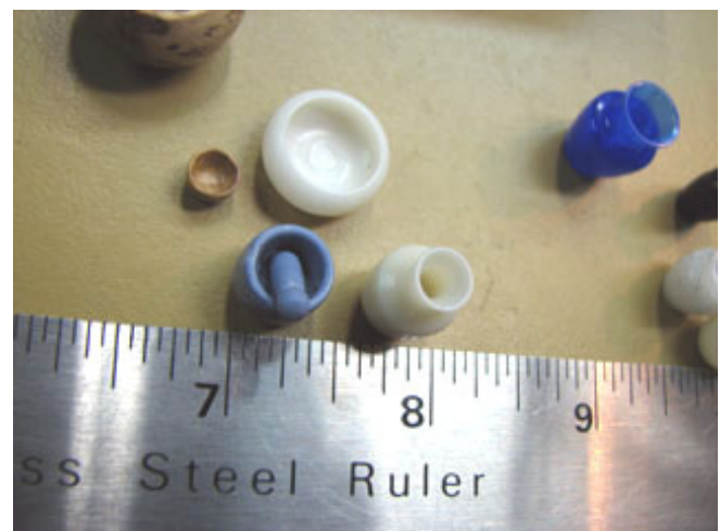
A “small” selection of her tiny work. Notice the ruler for scale.