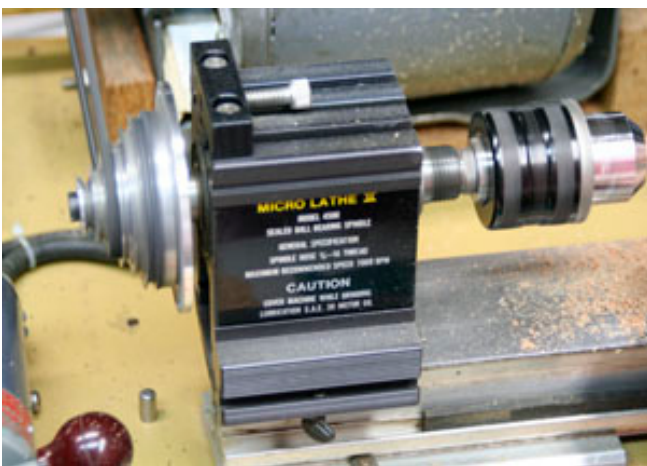
Many of us have mini lathes but Barb has a micro lathe.