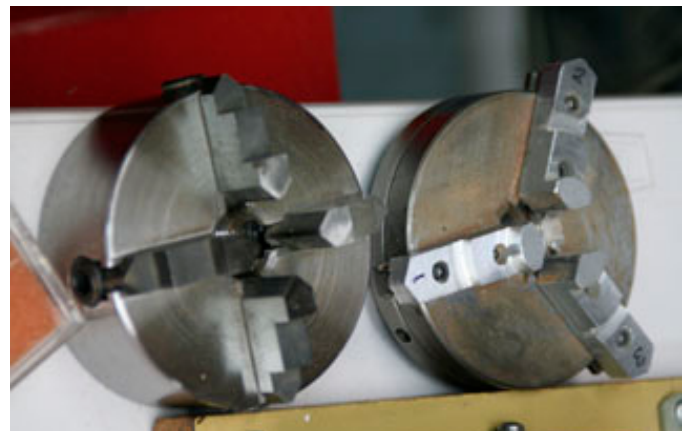
Two of her chucks