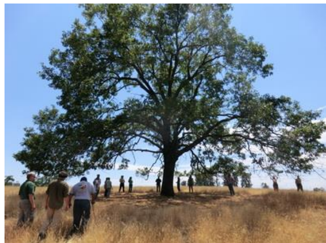
These are not easterners discovering their first true black oak, but tribal members and scientists gathering acorns for planting.