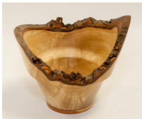
Natural edge maple bowl w/cedar foot 50-50