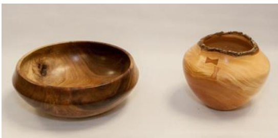
Thomas Schmida - natural edge bowl, Monterey Cypress, 50/50 and Black Acacia bowl, wipe on poly