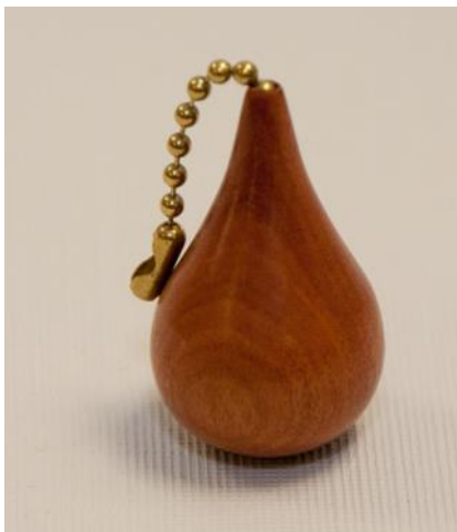
Tom Schmida - Light chain pull. red iron bark eucalyptus. wipe on poly