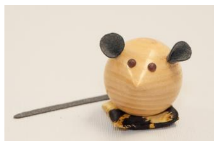
Mike Lanahan - A mouse. Ash body, purpleheart eyes, with shellac finish. Every mouse needs a mouse pad.