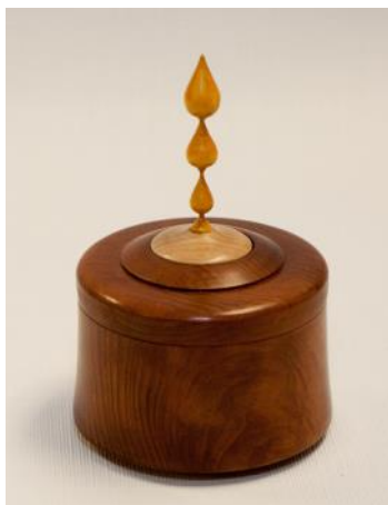
Jim Benson - tear- drop finial, foam brush handle wood, Mylands sanding sealer, amber shel- lac