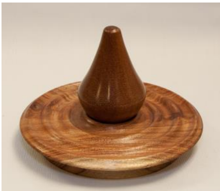
Colin Mackenzie - Rain drop (Bubinga) hitting a pond Black