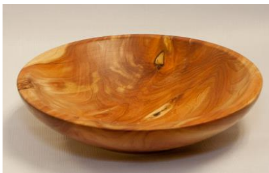
Jim Crowley - bowl and wood for identification