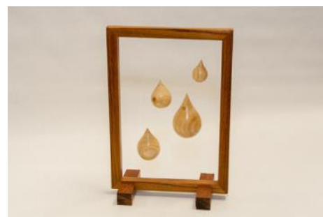
Gary Keogh - Raindrops in a window pane. SS & 50-50 - Wood: drops? Frame cherry