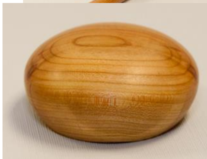
Jim Baker - Rain drop shaped cherry wood paper weight, and a n Off-set cane from Mahogany, but it didn't meet the "Off-Axis" criteria