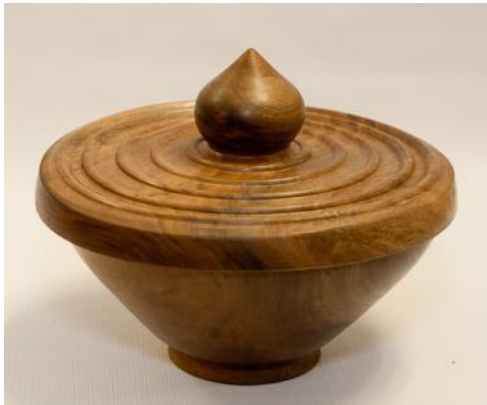
Milton West - bowl with rain drop lid, walnut, antique oil