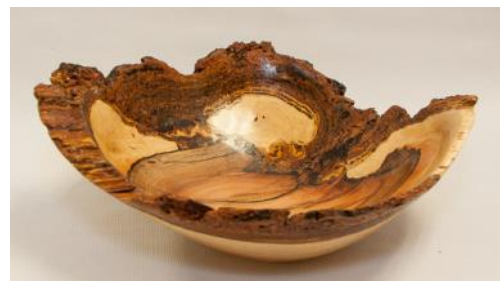
Grant Beech - Iron Bark Bowl. Looked like a useless piece of wood to start.