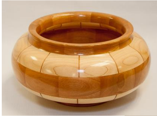
Dick Westfall - Segmented bowl, Maple and Cherry, Poly finish