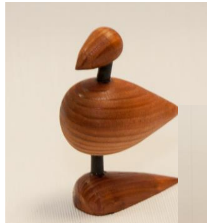
Herb Green - Bird Drops?