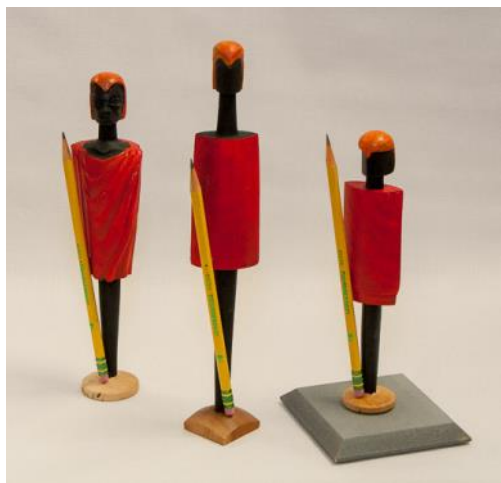
Charlie Belden - the pencil is mightier than the spear.