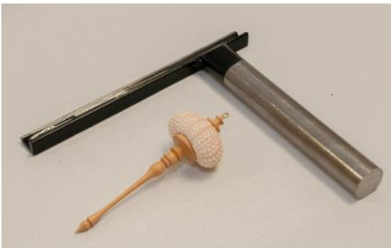
Brian Havens - Shop made tool rest for fine spindle work, and Rain cloud urchin ornament