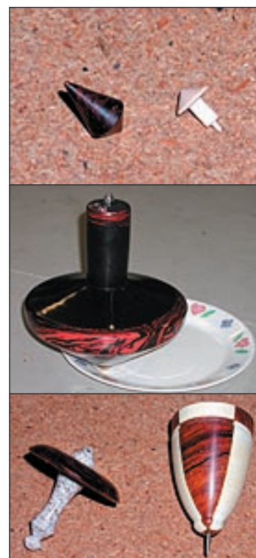
Top to bottom: Tinyist tops, largest top, and glue-up tops.

Next up was the String Launched Top spin off, with Phil Roybal, Dick Pickering, Herb