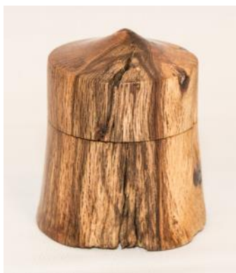
Pete Zavala, November challenge, driftwood lidded box.