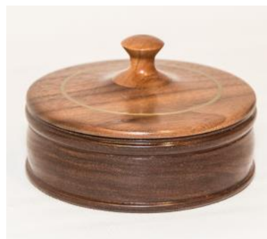
Tom Schmida, lidded box; walnut, maple, brass; poly