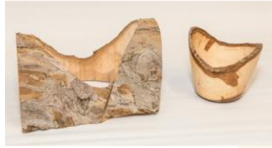
Greg Peck, Small natural edge bowl on a Delta 1642