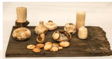
Charlie Belden , Beach Combs, Pepper Tree Wood, No Finish