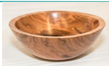
Gary Keogh , Eucalyptus Salad Bowl - GF Salad Bowl Finish