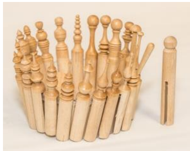
Solar Clothes Dryer Parts, Poplar?, 50-50