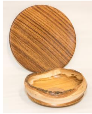
Gordon Patnude , 2- natural edge bowl previously shown with hole in the bottom; now repaired and refinished. Teak plate