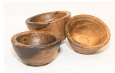
Bob Gerenser, 3 Small Valley Oak Bowls roughed out on a Powermatic 4224 Lathe