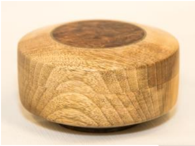
Pete Zavella , Lidded Box