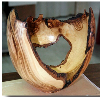
Best of Show by Jack Todd